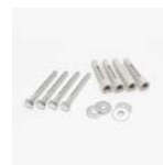
Wall fixing kit