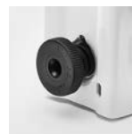
Adjustable rear foot