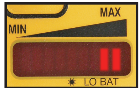
10 segment LED bar graph display (LS790B)

Ion-Pump® controls the industry's most sensitive and most effective tip