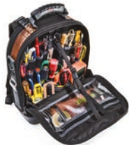
AX3502 TECH PAC LT