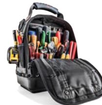
AX3513 TECH MCT